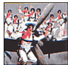
The Flying Elvi, complete with sunglasses, side-burned wigs and bell-bottom jumpsuits

Who knows what was in the air a few months back, but for some reason September was the month of chicken comparisons. Seattle Tilth honored the city's loveliest fowl with a sash and tiara, just weeks before the county's homeliest chicken was crowned at the Puyallup Fair.