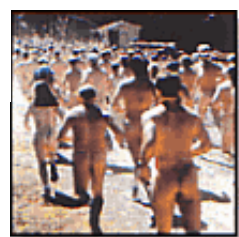
Birthdays suits are the preferred attire for the Bare Buns Fun Run.

For our faithful TG10 readers, we hope you'll enjoy strolling down the memory lane of this year's strange happenings. For those new to our beloved column, here's a peek at what you've been missing.