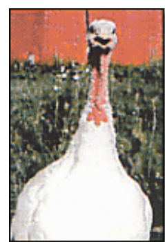
Meet Sassy. How could anyone resist this face?

August brought UFO experts and alien abductees to Seattle Center to share their stories with others who believe. (We'll let you decide if the gathering's proximity to the Space Needle was just coincidence.)